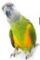
parrot / talk