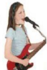
sister / sing