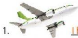
toy plane / fly