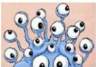
Zots has a lot of eyes