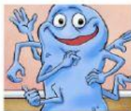
Zots has a lot of arms