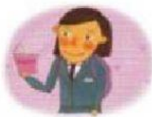
She is a student.