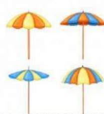
They are umbrellas