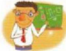
He's a teacher.