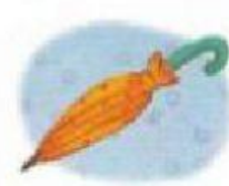
It is an umbrella.