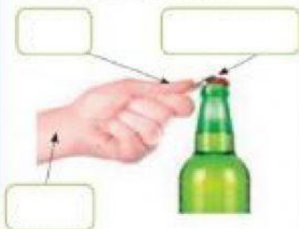
a bottle opener

Some levers have the load in the middle.