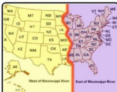
west of Mississippi