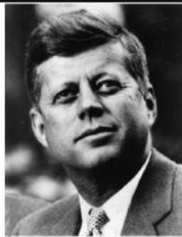
John F. Kennedy