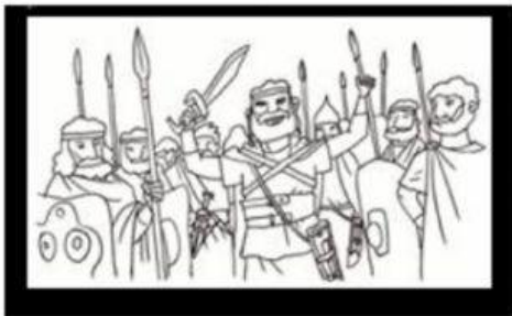
Leader of the Lusitanians: _____