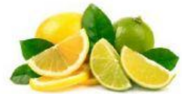
Lemon & Lime