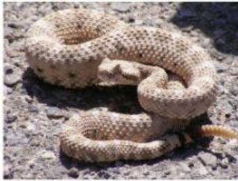
The pink rattlesnake startles hikers in the canyon as it suns itself on warm rocks along trails.

The Grand Canyon is a national park. Over 5 million people visit it each year. Visitors enjoy hiking, camping, and white water rafting. Hiking in the canyon can be very dangerous. Many people become dehydrated from the high temperatures of 100° or more and not having enough water. Many people have also fallen off of high cliffs. About 600 people have died in the Grand Canyon in the last 150 years.