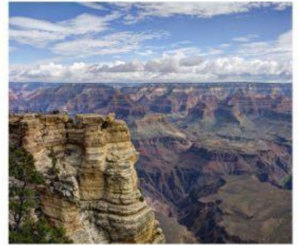
Canyons can be found all over the world. One of the biggest and most famous canyons is the Grand Canyon which is located in Arizona.

There are six species, or kinds, of rattlesnakes that live in the Grand Canyon. The most common is the Grand Canyon Pink Rattlesnake. Its hue matches the rocks found in the canyon.