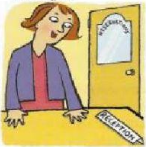
Here's the reception desk.