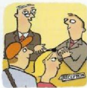
These guests are checking in.