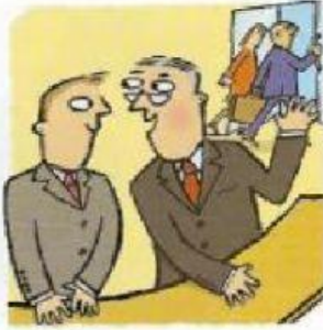
Those guests checked out five minutes ago.