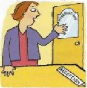
There's the reservations office.