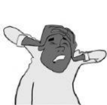
1 a headache

stomach ache a sore throat a black eye a sprained ankle a headache a broken leg