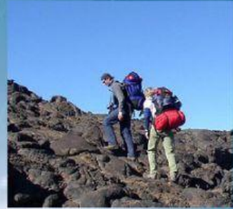
CLIMB A VOCANO