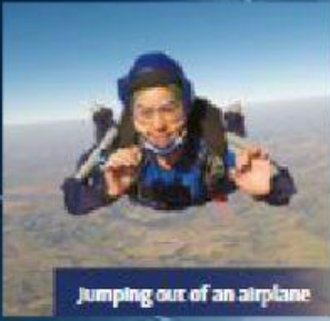
Jumping out of an airplane