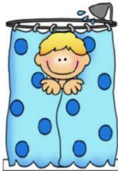
have a shower