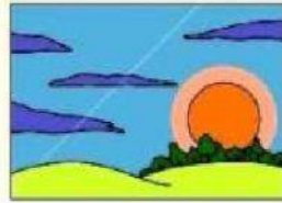
In the evening