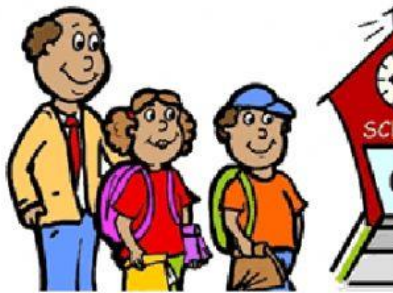
go to school