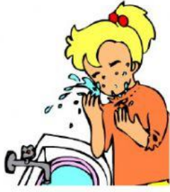
Wash my face