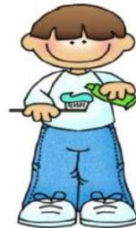
brush (my) teeth