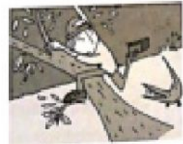
7. hike / climb