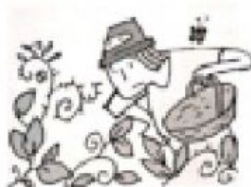
2. look for / sleep