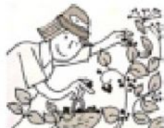
3. cook / find