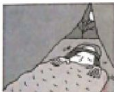
4. climb / sleep