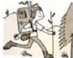
1. hike / build