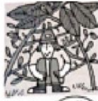
look for / build

1) LOOK AT THE PICTURES AND CHOOSE THE CORRECT OPTION