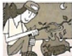
5. cook / fish