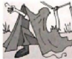
6. chop / camp