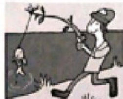
8. fish / sleep