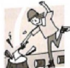
9. chop / find

2) COMPLETE THE SENTENCES WITH THE WORDS BELOW. DRAG AND DROP