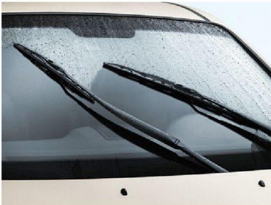
The Windscreen Wiper

It was 1948. George de Mestral returned from a walk with his dog. He found out they were both covered in sticky balls from plants. George noticed how they caught hold of his clothes, and an idea for a new material was born! Today, Velcro is used on clothes and bags to hold two pieces together.