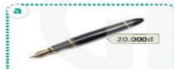
pen / twenty thousand dong