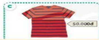
T-shirt / fifty thousand dong