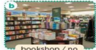
bookshop / no