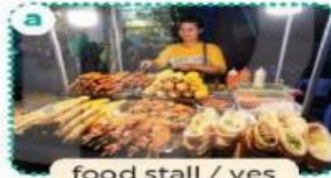
food stall / yes