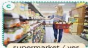
supermarket / yes