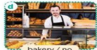
bakery / no