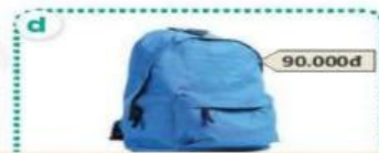
school bag / ninety thousand dong