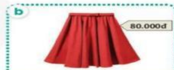
skirt / eighty thousand dong