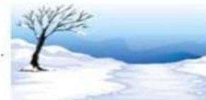
6. It is ..... a. cold B. hot