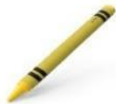
5. It is a ..... crayon. a. red b. yellow