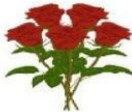
2. They are ..... roses. a. blue b. red