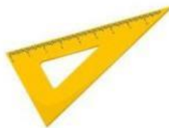
5. It's a ..... ruler.