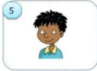
dark/ Your hair/ is