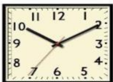
4. It is a ..... clock. a. round b. square