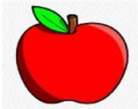
1. The apple is ... red ...