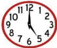
4. It's a ..... clock.