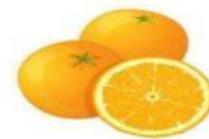
3. They are ..... oranges. a. green b. orange