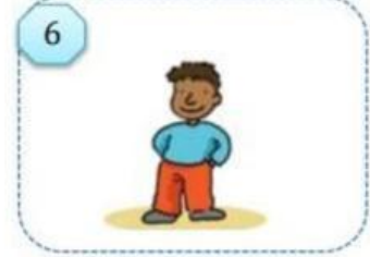
short/ You/ are