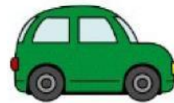
3. The car is .....