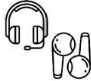
headphones / earbuds