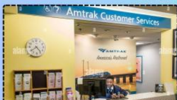
Customer Service Counter