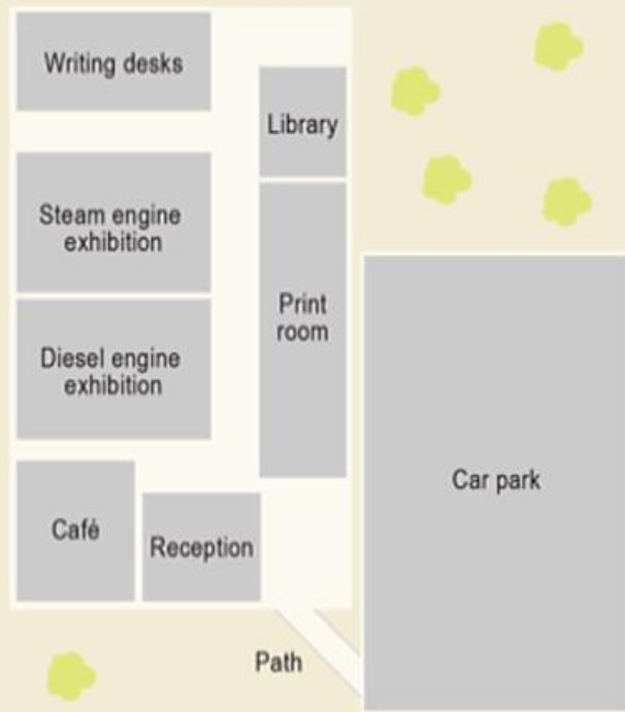
Science and Technology Museum 1996