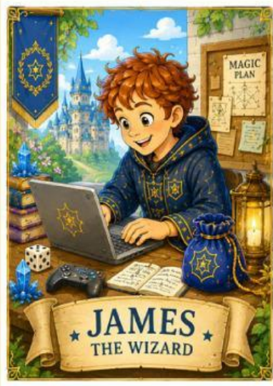
Imagen creada con ChatGPT (OpenAI, 2026).

This is James. He is Peter and Emily's best friend and a student at the Golden School. James is funny and energetic, but his magic is always chaotic.