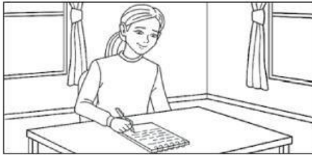
1 write a story