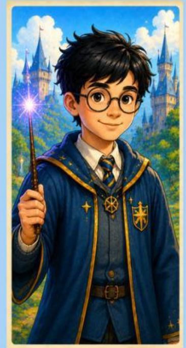
Imagen creada con ChatGPT (OpenAI, 2026).