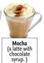
Mocha (a latte with chocolate syrup.)