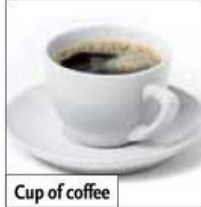
Cup of coffee