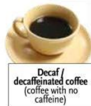
Decaf / decaffeinated coffee (coffee with no caffeine)