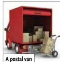
A postal van