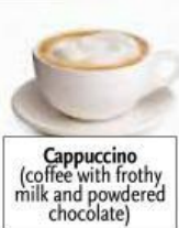
Cappuccino (coffee with frothy milk and powdered chocolate)