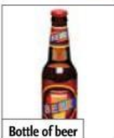
Bottle of beer