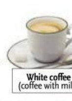
White coffee (coffee with milk)