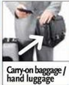
Carry-on baggage / hand luggage