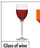
Glass of wine