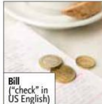
Bill ("check" in US English)