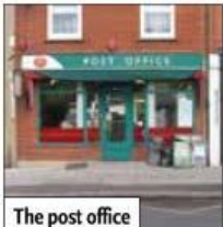
The post office