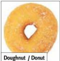
Doughnut / Donut