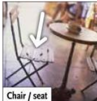
Chair / seat