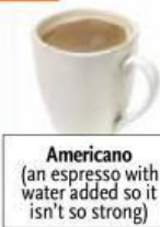
Americano (an espresso with water added so it isn't so strong)