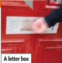
A letter box