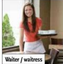
Waiter / waitress