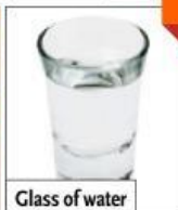
Glass of water