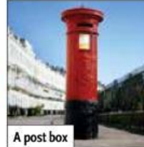
A post box