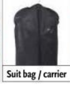
Suit bag / carrier