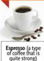
Espresso (a type of coffee that is quite strong)