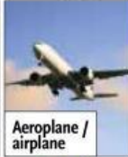
Aeroplane / airplane