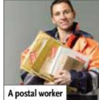
A postal worker