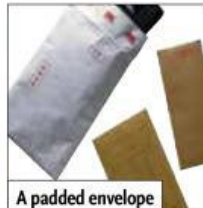
A padded envelope