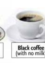
Black coffee (with no milk)