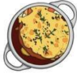
The food tastes great!