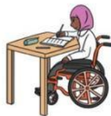
We should study.