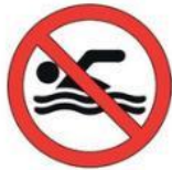
He shouldn't swim there.