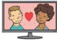
The movie is good!