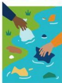
CLEAN UP (limpiar)