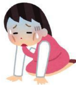
GIVE UP (rendirse)