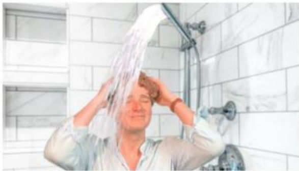
3. I _____.