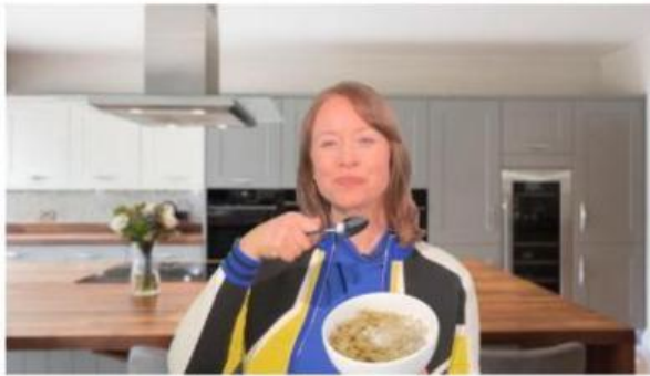
1. I eat breakfast.