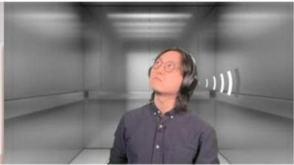
2. I _____.