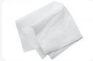
2 a t _____