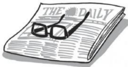
1 Your glasses are on _____ the newspaper.

b Complete the sentences with in, on, or under .