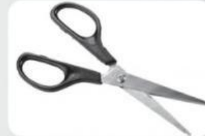
6 sc _____