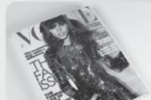
9 a m _____

b Complete the sentences with in, on, or under .