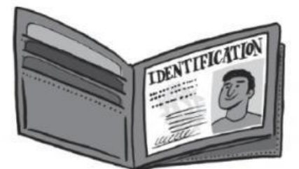
6 My identity card is _____ my wallet.