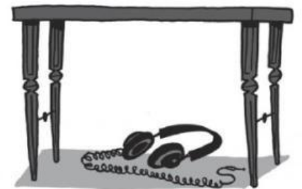
3 Her headphones are _____ the table.