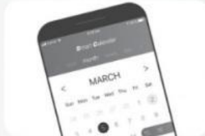
5 a c _____