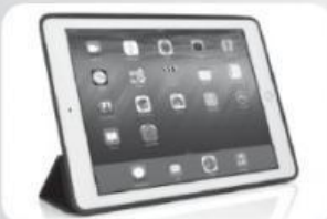
7 a t _____