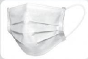
4 a m _____