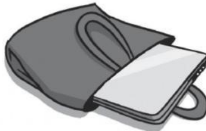
2 My laptop is _____ my bag.