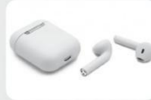
3 ea _____