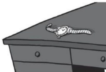
5 His watch is _____ the desk.