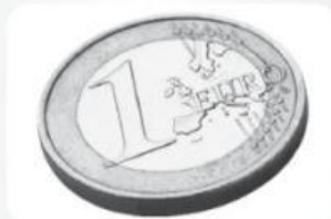
8 a c _____