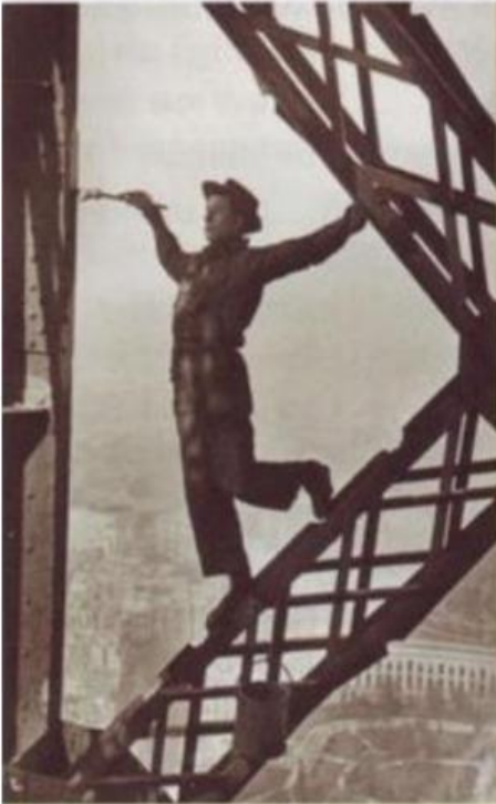
The Eiffel Tower painter Marc Riboud 1953

IT WAS 1953. The photographer was living in Paris. He didn't have much money, and was living in a small room, and taking photos of the city every day. One day he saw that some people were painting the Eiffel Tower, and he decided to take some photographs. He went up the tower and suddenly he saw the man in the photo. The man was painting. The photographer was very nervous because he was sure that the painter was going to fall. He took his photo and a few weeks later the photo was in Life magazine.