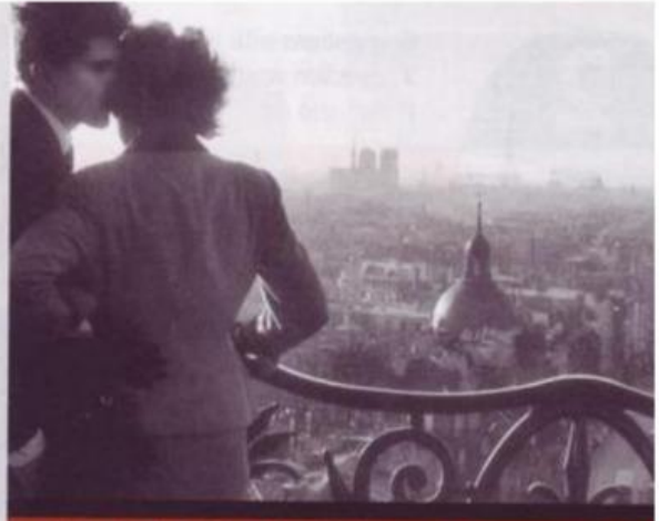
Willy Ronis talks about his most famous photo

It was March 1957 and I was taking photographs in Paris. One afternoon I went up the Bastille and I saw two lovers on a balcony. They were standing very near each other. They were talking. I took just one photo and they didn't hear me. I called it Lovers at the Bastille . Luckily for me this photo became very popular in France. Soon posters and postcards with my picture of the two lovers were everywhere. But I never knew who the two young people were. They never contacted me.'