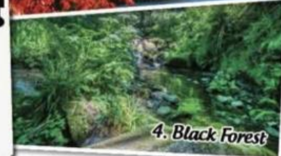
4. Black Forest