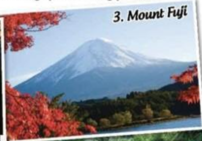
3. Mount Fuji