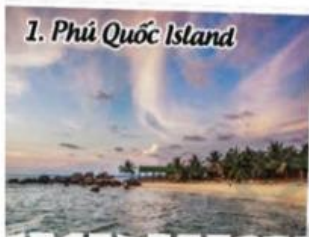
1. Phú Quốc Island

These places are the best for people who like: doing sports/taking photos.