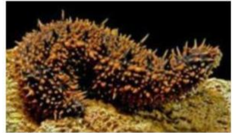
[Blank label box]