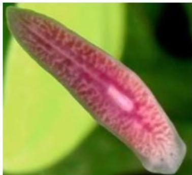
[Blank label box]