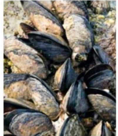
[Blank label box]