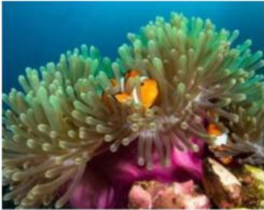
[Blank label box]