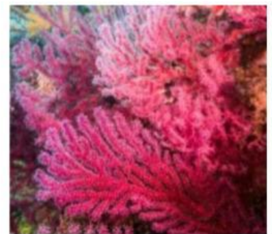
[Blank label box]