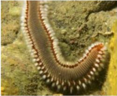
[Blank label box]