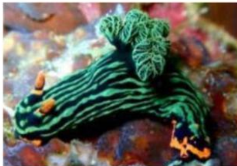
[Blank label box]