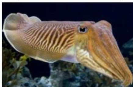
[Blank label box]