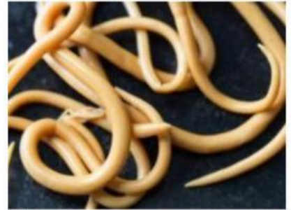
[Blank label box]