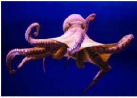
[Blank label box]