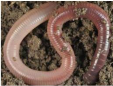
[Blank label box]