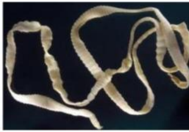
[Blank label box]