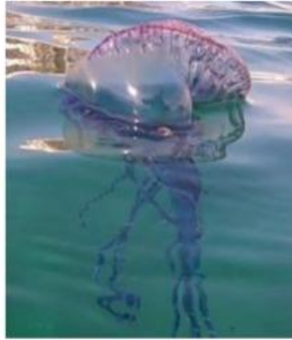
[Blank label box]