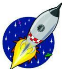
4. a spaceship/ a river