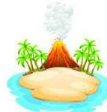
6. a museum/ a volcanic eruption