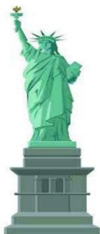
5. a fountain/ a statue