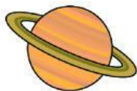
1. a planet/ a spaceship