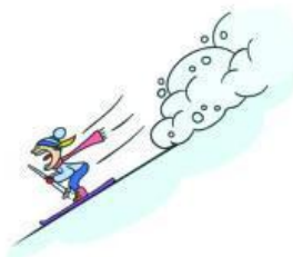
3. a rocket/ an avalanche