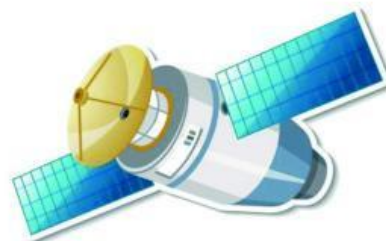
8. an explosion/ a satellite