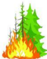
7. a forest fire/ a tornado