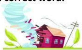
2. a square/ a tornado