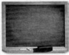
1. a board