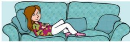
4 Fridays / relax on the sofa