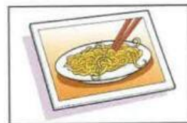
a plate of noodles