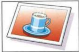
a cup of coffee

Listen and write a letter in each box. There is one example.