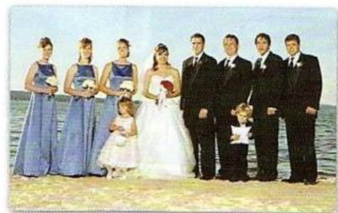
an American wedding party

The 1 bride usually wears a white 2 _____ and 3 _____ and carries a 4 _____ of flowers. A typical wedding party includes a 5 _____, usually the bride's closest friend, and a 6 _____, typically the groom's best friend. There are usually several bridesmaids, who all wear the same dress, and a few groomsmen.