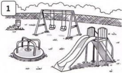
pla y grou nd