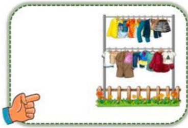
1. Those are clothes.