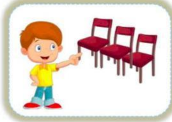
2. These are chairs.