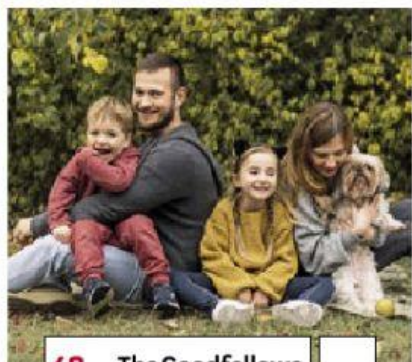
48 The Goodfellows