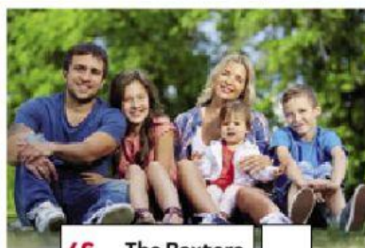
46 The Baxters

The Taylors want to move to Shoreham, somewhere outside the town centre. They are a big family with five children. They want to buy a four-bedroom house with a garden for their children to play in. Besides a garden, there must also be a garage. They can't afford to pay more than £450,000.