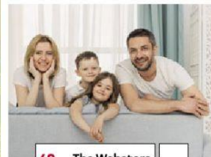
49 The Websters

The Goodfellows are trying to find a three-bedroom house in a quiet area in the Shoreham suburbs. The house must have both a garden and a garage. The family can't afford to pay more than £450,000.