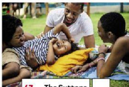
47 The Suttons

The Baxters have just won the lottery and want to invest their money in a house. They want to buy a three-bedroom house with at least a small garden. They need a garage for their car as well. They would love to go to cafés with their friends quite often, so the house should not be far from the centre. They can pay up to £600,000.