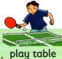
play table tennis