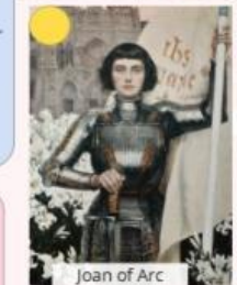
Joan of Arc