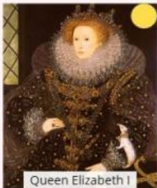
Queen Elizabeth I