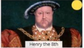
Henry the 8th