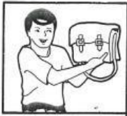
I have a bag.