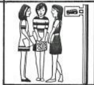
We waited for an hour.

In the sentences above, 'a' and 'an' are used with the nouns 'bag', 'apple' and 'hour'.