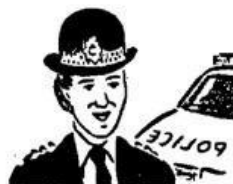
10. police _____