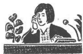
12. reception _____