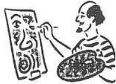
2. art _____