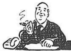
6. manage _____