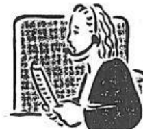
7. interpret _____