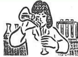
3. science _____