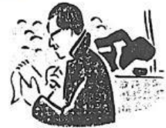
4. journal _____