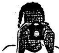
9. photograph _____