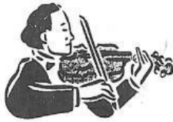
1. music musician