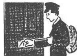
11. post _____