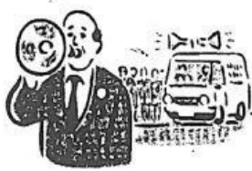
5. politics _____