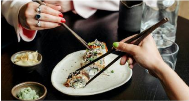
C. Suggested verb: EAT