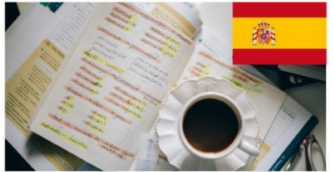
F. Suggested verb: STUDY