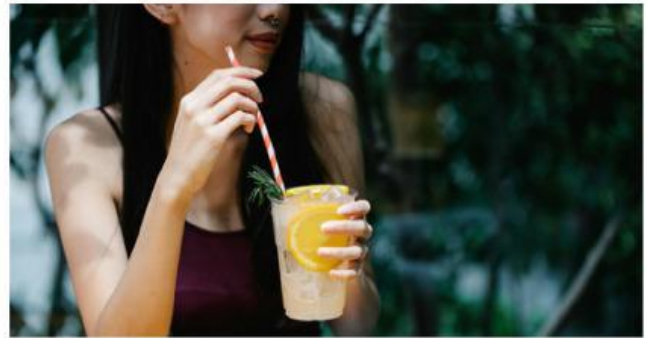
D. Suggested verb: DRINK