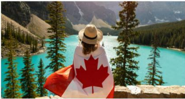
E. Suggested verb: TRAVEL