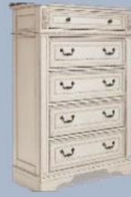
Chest of drawers