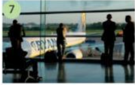
7 wait for a flight /weɪt fər ə flaɪt/