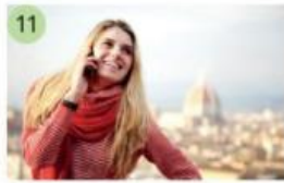
11 call home /kɔːl hoʊm/