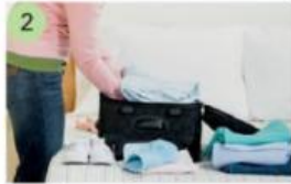
2 pack a suitcase /pæk ə 'sʊtkers/