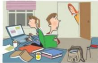
5 We for an exam. (study)