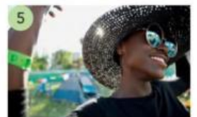
5 wear sunglasses /wer 'sʌŋglæsəz/