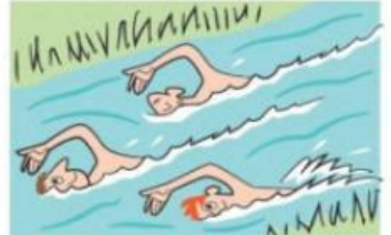
6 They in the river. (swim)