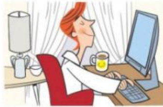
3 She at home today. (work)