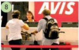
8 rent a car /rent ə kɑː/