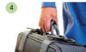
4 carry a suitcase /'kæri ə 'sʊtkers/