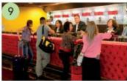
9 arrive at a hotel /ə'raɪv æt ə hou'tel/ (in a city)