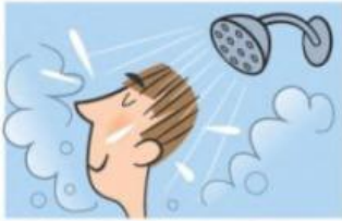
He 's taking a shower. (have)

a Write sentences in the present continuous for each picture. Use contractions.