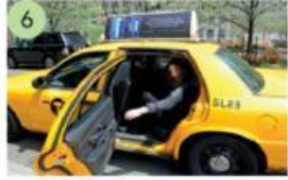
6 get a taxi (a train, a bus) /get ə 'tæksi/