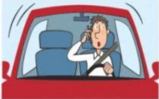
1 I can't talk now. I . (drive)