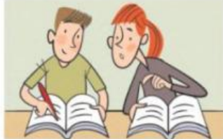
2 You the wrong exercise! (do)