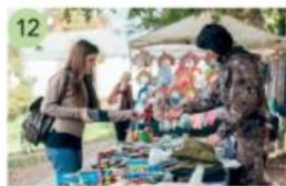
12 buy presents /baɪ 'preznts/