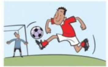
4 He soccer. (play)