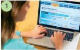
1 book tickets /buk 'tɪkəts/