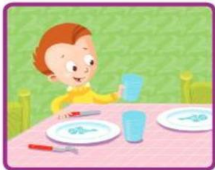
set the table