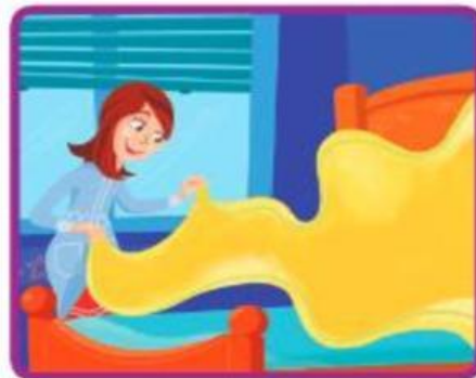
make the bed