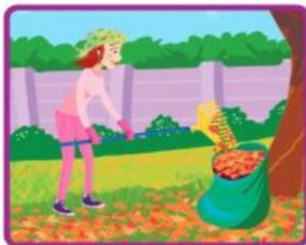
collect the leaves