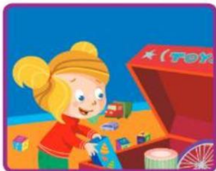
put away the toys