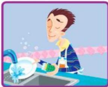
wash the dishes