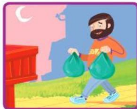
take out the garbage