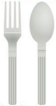
fork and spoon