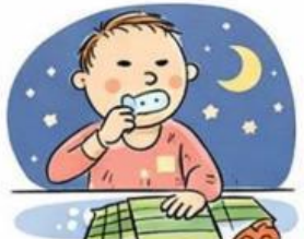
Brush my teeth (at night)