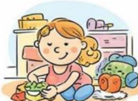
Tidy my bedroom