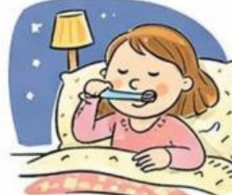
Go to sleep