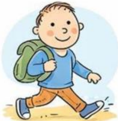
Go to work/Go to school