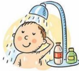
Take a shower