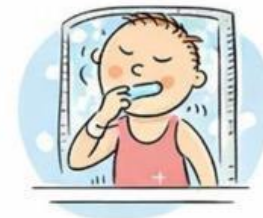
Take a shower (at night)