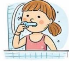
Brush my teeth