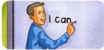
2. at school