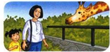
6. at the zoo