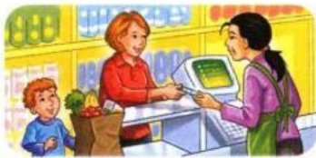
4. at the store