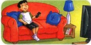
1. at home