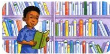
5. at the library