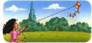
3. at the park