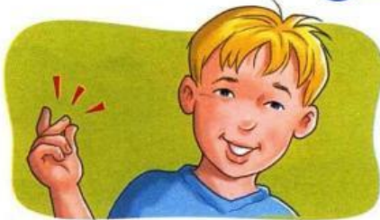
1. Snap your fingers.