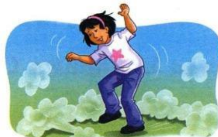
2. Stamp your feet.