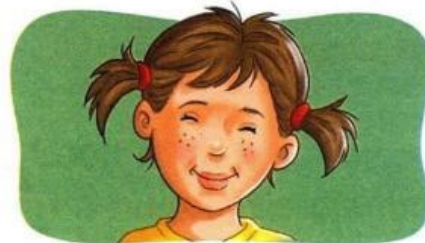
4. Close your eyes.