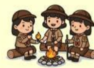
COOK ON THE CAMPFIRE