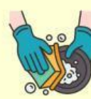
DO THE DISHES