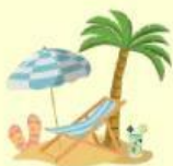
GO TO THE BEACH